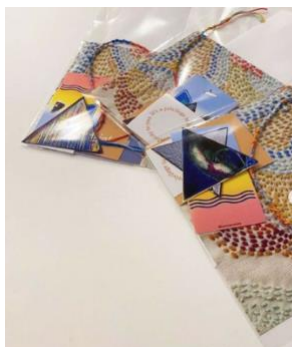
Connection & Desire art pack from the Incubator cohort

The Incubator artists rose to the challenge of engaging the public by producing videos for The City of Waterloo's Lumen Lite and offering