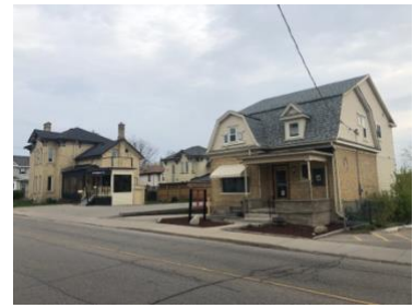
Art Incubate Studios and Galleries

Art Incubate began on May 1, 2019 when HIP Developments donated two adjacent buildings on Regina St. in Waterloo for AP to manage as a non-profit initiative, with two gallery meeting spaces and sixteen visual artist studio spaces.