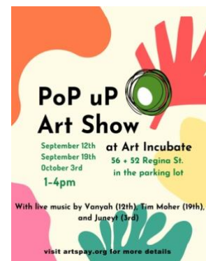
Pop-Up Market promo